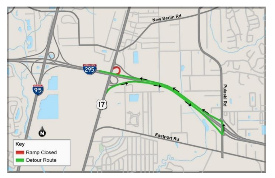
Improve Safety, Enhance Mobility, Inspire Innovation NFLRoads.com | @MyFDOT_NEFL | Facebook.com/MyFDOTNEFL

Drivers on U.S. 17 northbound will be detoured to I-295 eastbound to Pulaski Road, where they can access I-295 westbound.